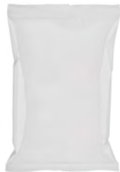
standard pillow bag (standard PE or laminated)